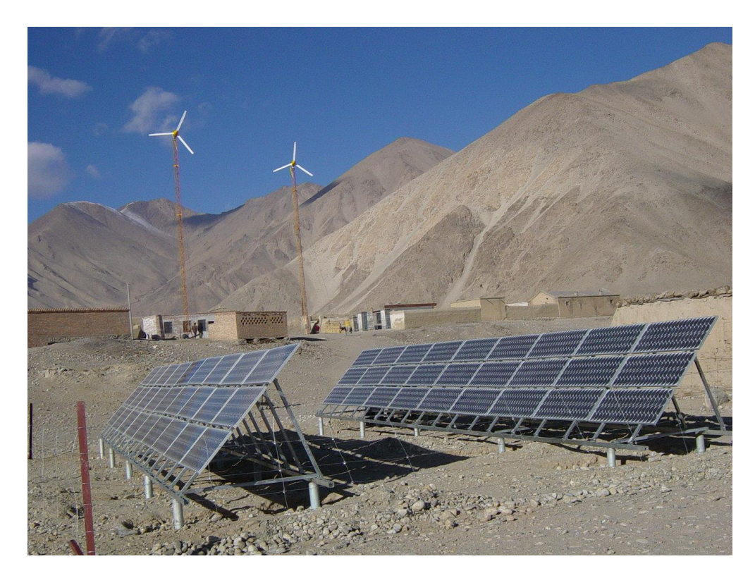
Xinjiang Province, China

BWC was formed in 1977 and has been manufacturing small wind turbines since 1980. BWC wind turbines have been installed in all 50 U.S. states and over 100 countries.